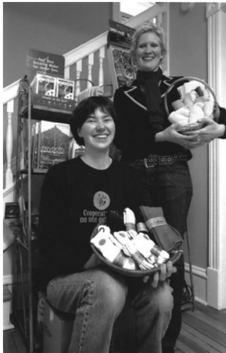
Linden Hills staff displaying their wares.

The store is open from 10 a.m. to 7 p.m. Monday through Saturday and noon to 6 p.m. Sunday at 2822 West 43 rd Street. A grand opening celebration is in the works for April 22, Earth Day, with giveaways,