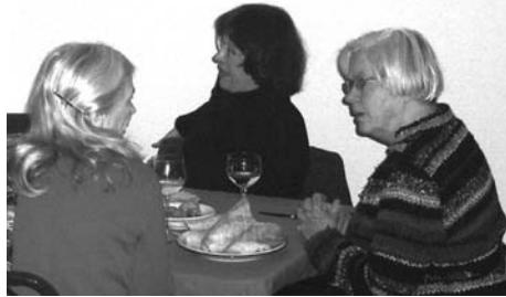
More members enjoying the atmosphere at a cheese tasting.

There are still a lot of projects in development, including even more education and outreach opportunities,