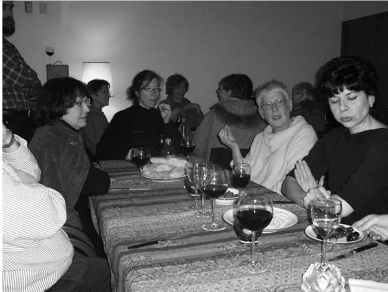
Say Cheese! Soft ripened cheeses and great conversation what more could you ask for? Find out about our upcoming educational programs on page 3.